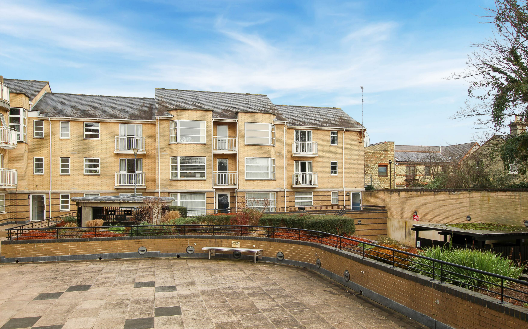
Petersfield Mansions, Cambridge, CB1 1BB